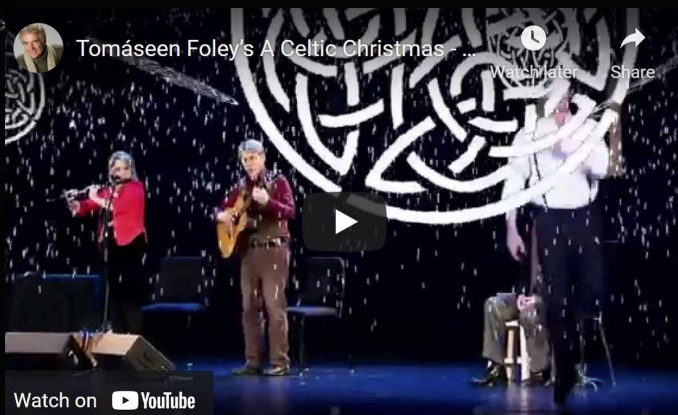
30-Second Promo Video